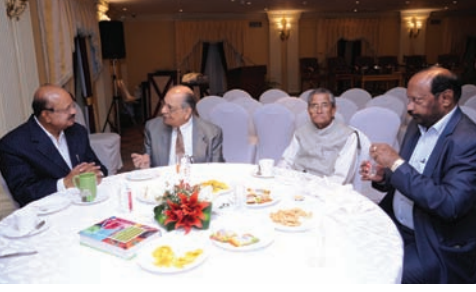
The high-tea during the function