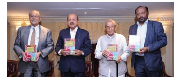
Release of the second book entitled, "Sustainable Horticultural Development and Nutrition Security"