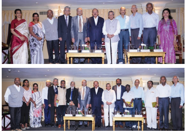
PNASF team and some authors of the books along with Dignitaries

The Book-Release Ceremony was covered by the television and the newspaper media. The support extended by the Board of Trustees is