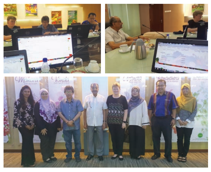
During SEAVEG Coordination Committee Meeting

The Southeast Asia Vegetable Coordination Committee met at the MARDI Head Quarters, Kuala Lumpur, Malaysia to discuss the preparation of SEAVEG-2019 scheduled during May 06, 2018.