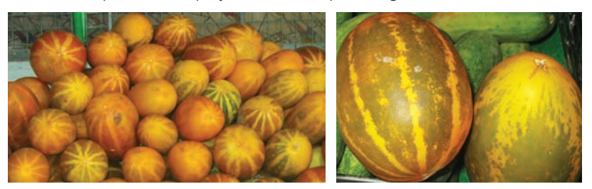
Mangalore Southekayi (Cucumis melo var. conomon)

at the Vice Chancellor's Meeting Hall of the Regional Office, University of Horticultural Sciences Campus, GKVK, Bengaluru. In this document the two institutions have agreed that the PNASF will support the research project for a total sum of Rs. 12,55,000/- for a period of two years, 2018 and 2019 and the UHSB will implement the project within the period agreed.