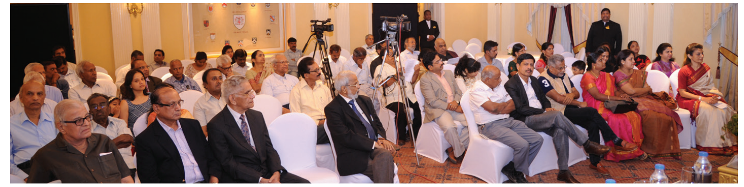
Audience during the function